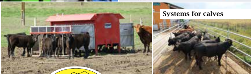
Systems for calves