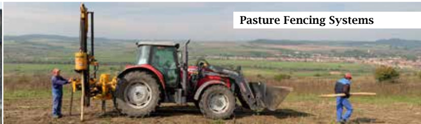
Pasture Fencing Systems